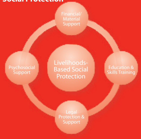
Figure 1: Elements of Livelihood-based Social Protection